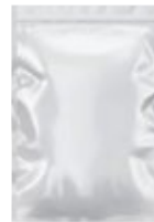
Three Side Seal