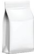
Flat Bottom Bags